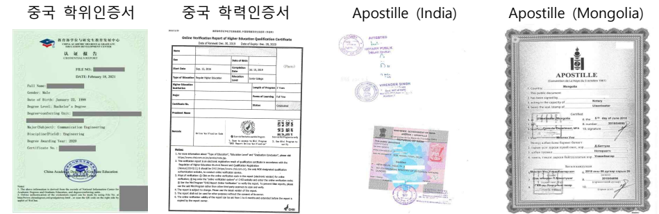
Verification of diploma from Korean Embassy